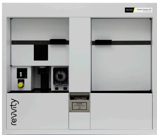
Model 307 Sample Oxidizer