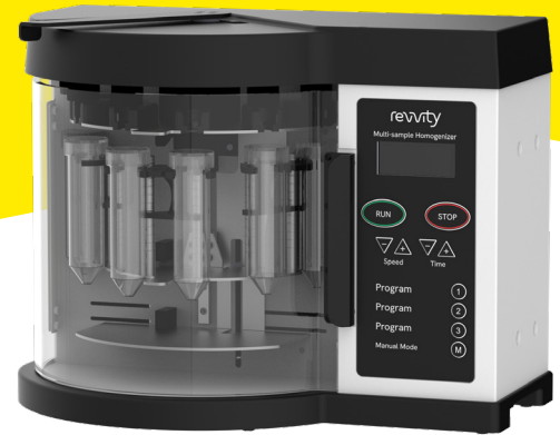
Part number: 06-021