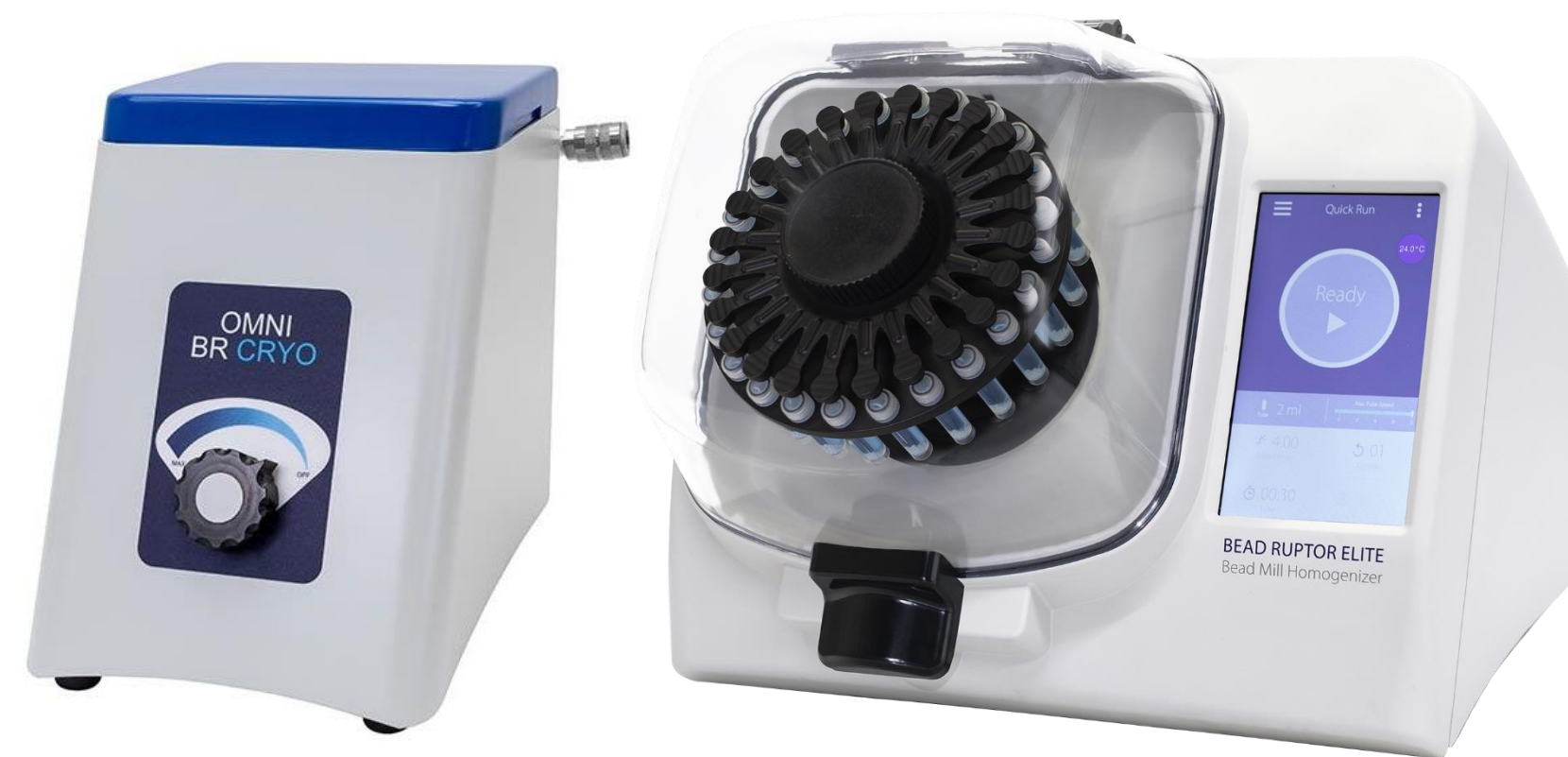
Figure 1: Images of table-top units for the Omni BR cryo unit (optional, L) and Omni Bead Ruptor Elite bead mill homogenizer (R).

10 µL of eluted DNA was added to qPCR mix (Bio-Rad) along with 5 µM of forward and reverse 18S primers. The 18S gene was targeted with forward primer 5' - CAG CAG CCG CGG TAA TTC C - 3', reverse primer 5' - CCC GTG TTG AGT CAA ATT AAG C - 3' yielding a product size of 676 bp. An 18S-positive DNA extract was used as the positive control along with nuclease-free water (negative control). Reactions were run a real time PCR instrument, amplified for 40 cycles and visualized via gel electrophoresis. Sample Cq values were assessed.