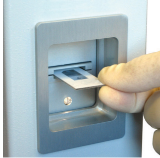
Insert disposable slide