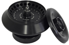
24 x 2 mL Microcentrifuge Tube Rotor with Lid