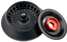
24 x 2 mL Microcentrifuge Tube Rotor with Aerosol Lid