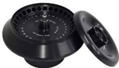
30 x 2 mL Microcentrifuge Tube Rotor with Lid