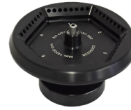
4 x 8 PCR Strip Rotor