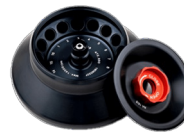
16 x 5 mL Microcentrifuge Tube Rotor with Aerosol Lid