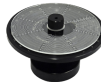
24 x Glass Hematocrit Rotor