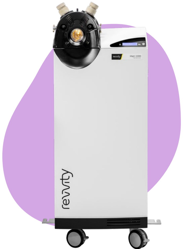
QSight® 225MD UHPLC screening system

MSMS Workstation software at the center of your workflow: