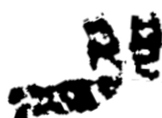
Figure 1: Pt 1 initial Karyotype showing Sex chromosomes