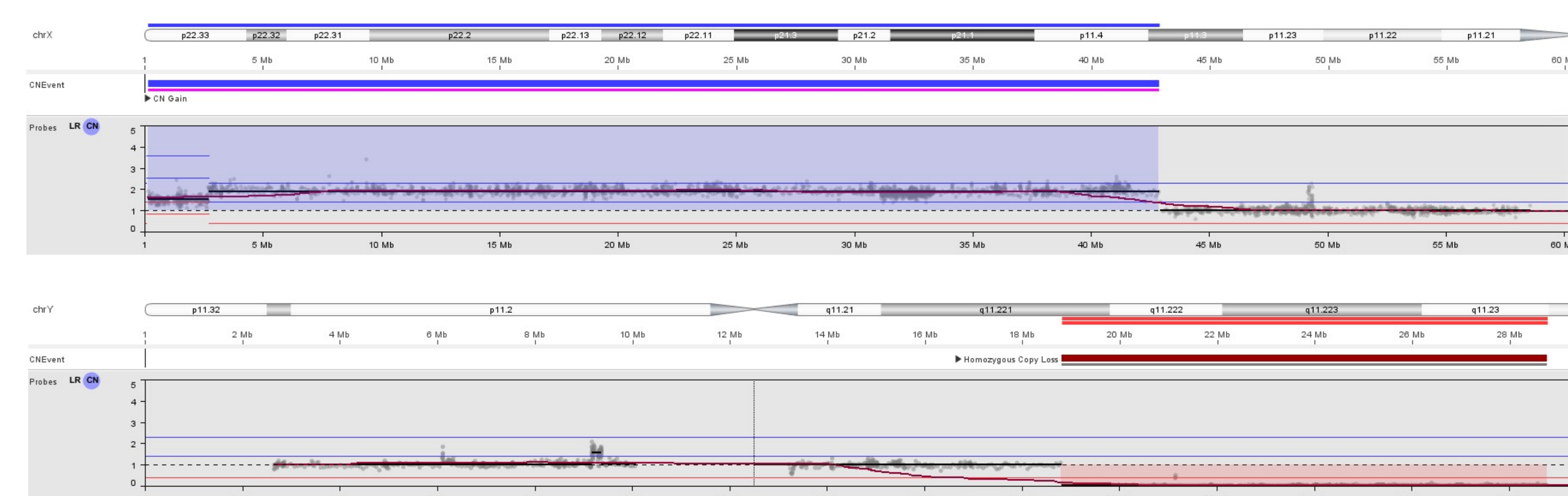
Figure 2: Pt 1 WES NxClinical result: gain of Xp22.33p11.3 including the DAX1 gene (Top) and loss of Yq11.221q11.23 (Bottom)