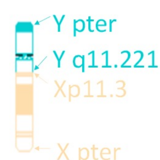
Figure 3: Pt 1 final Karyogram based on WES result: 46,X,der(Y)t(X;Y)(Ypter→Yq11.221::Xp22.33→Xp11,3)

Patient 2: 2 yr old phenotypic female with labial swelling, vaginal prolapse, bilateral corneal opacities, microphthalmia, bilateral gonadoblastoma and bilateral nephroblastoma