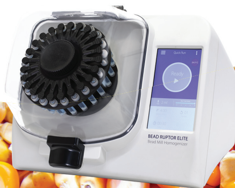
Omni Bead Ruptor Elite™ bead mill homogenizer