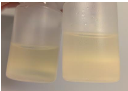
Fig.1. Typical appearance of 10X HiBlock Buffer.